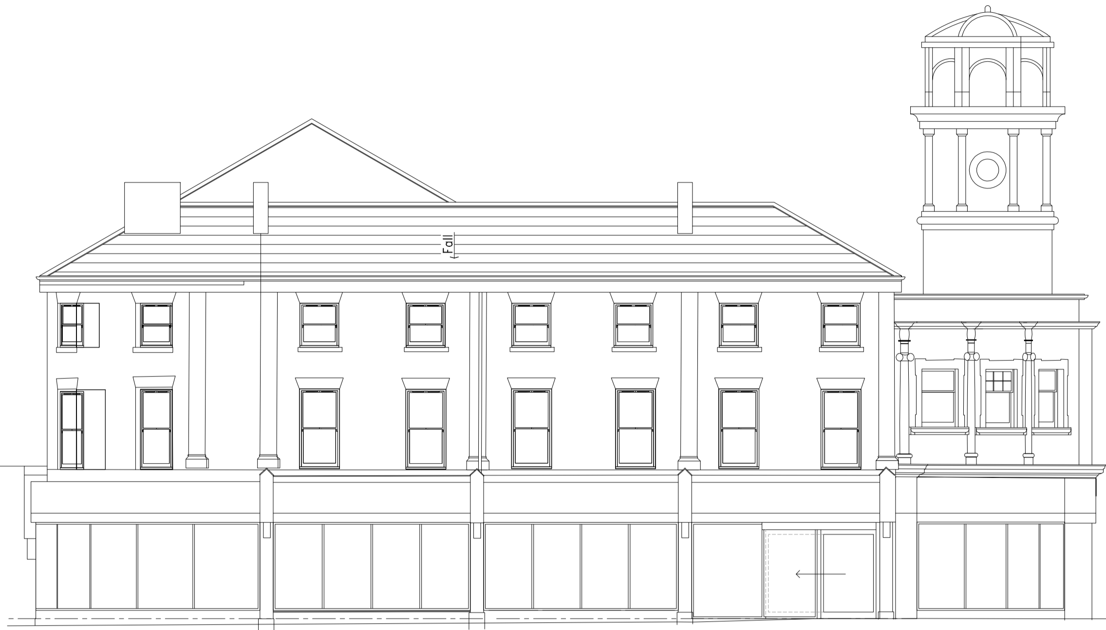
Existing St Lukes place elevation