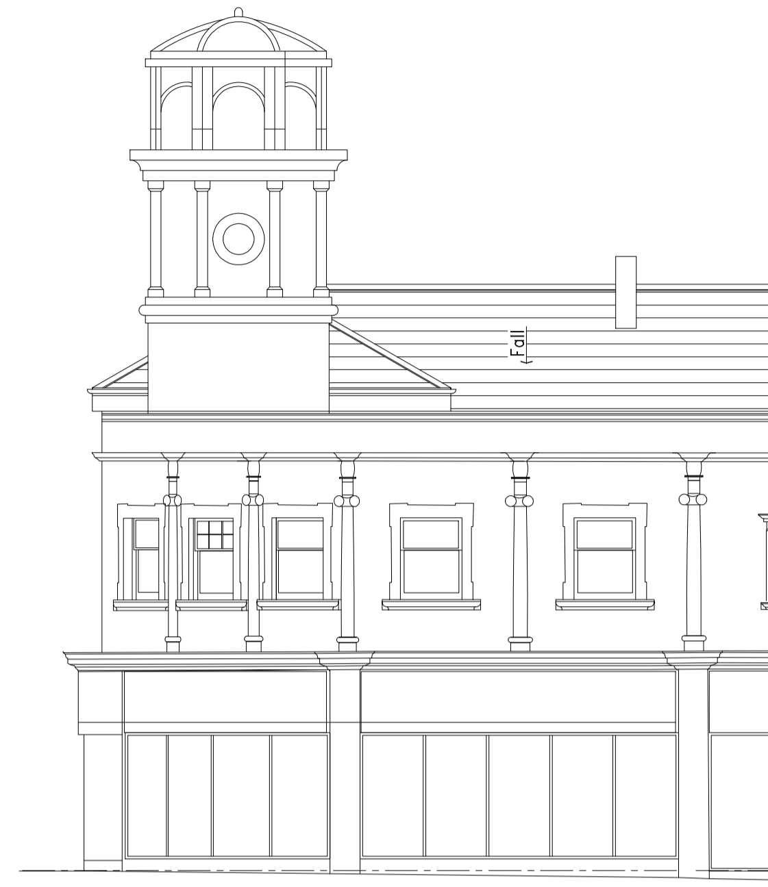
Existing Renshaw street elevation