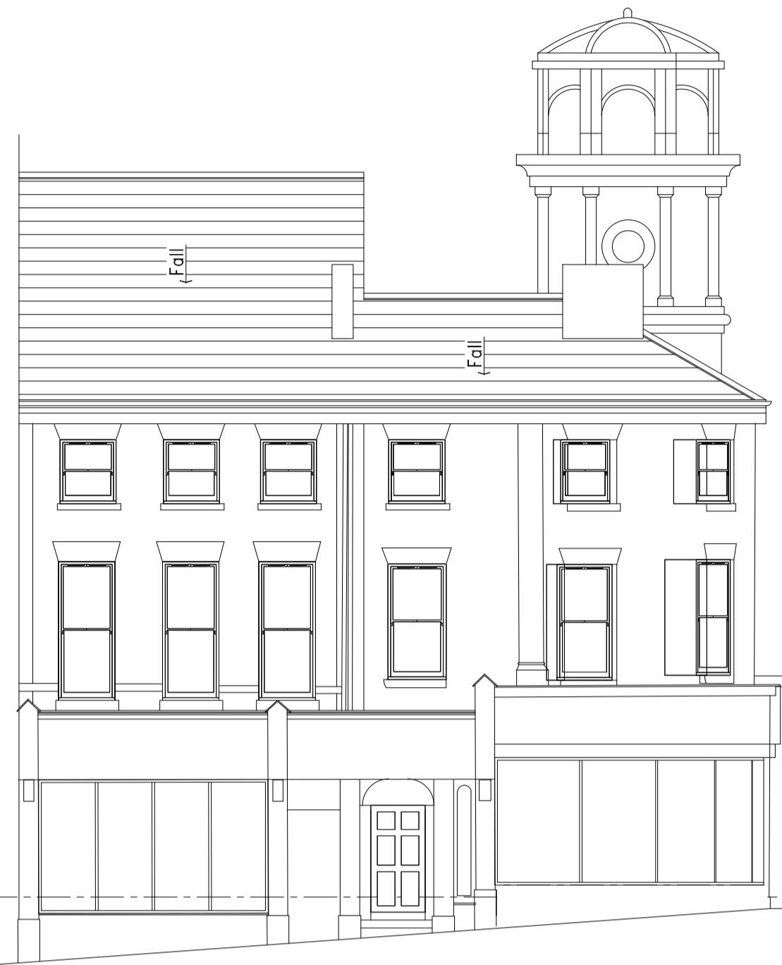
Existing Bold street elevation

Notes: Drawings are based on survey data and may not accurately represent what is physically present. Do not scale from this drawing. All dimensions are to be verified on site before proceeding with the work. All dimensions are in millimeters unless noted otherwise. MissionMars shall be notified in writing of any discrepancies.