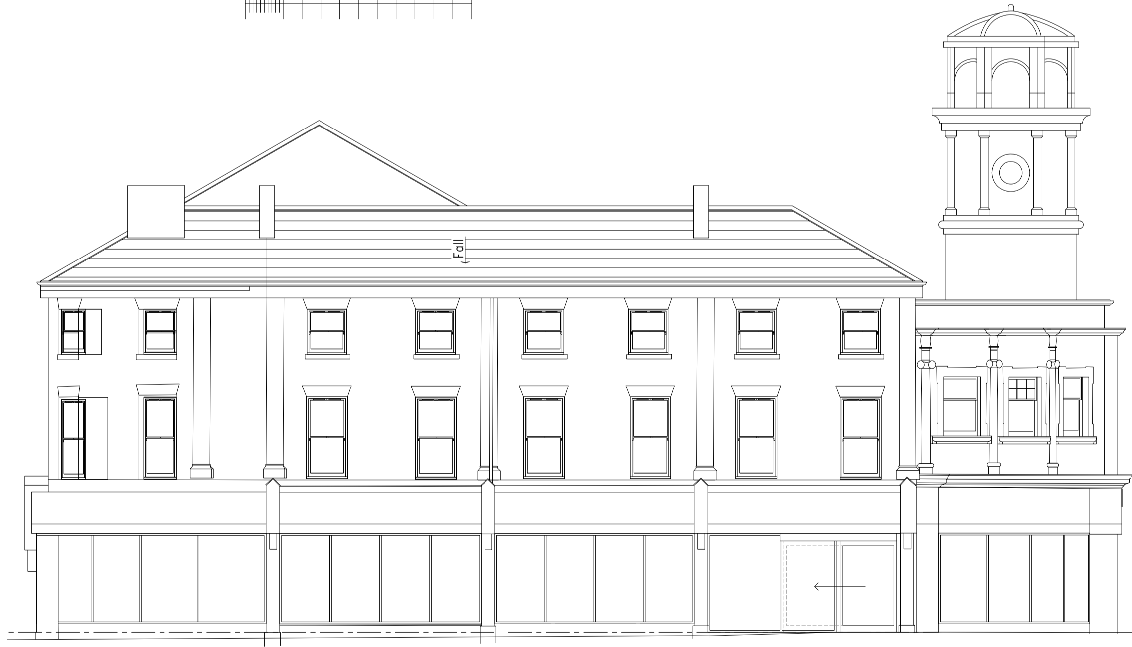
Proposed St Lukes place elevation

New entrance formed in existing shopfront with door & frame to match existing. New steps formed in materials to match existing.